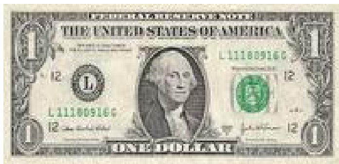
One dollar = 100 cents