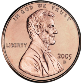
Penny = 1 cent