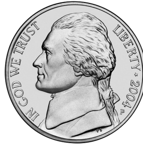
Nickel = 5 cents