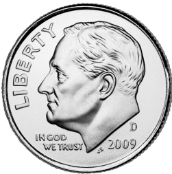
Dime = 10 cents