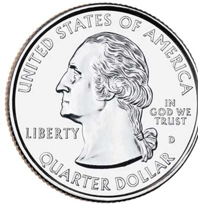
Quarter = 25 cents